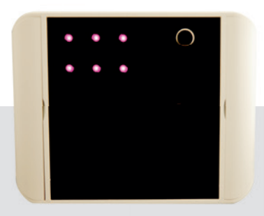
Compact Camera, Item no.: BTV101