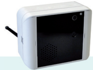
Compact Camera, Item no.: VID101