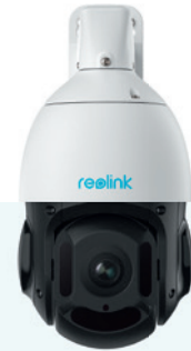
PTZ Camera incl. Infrared (optional), Item no: VID150A